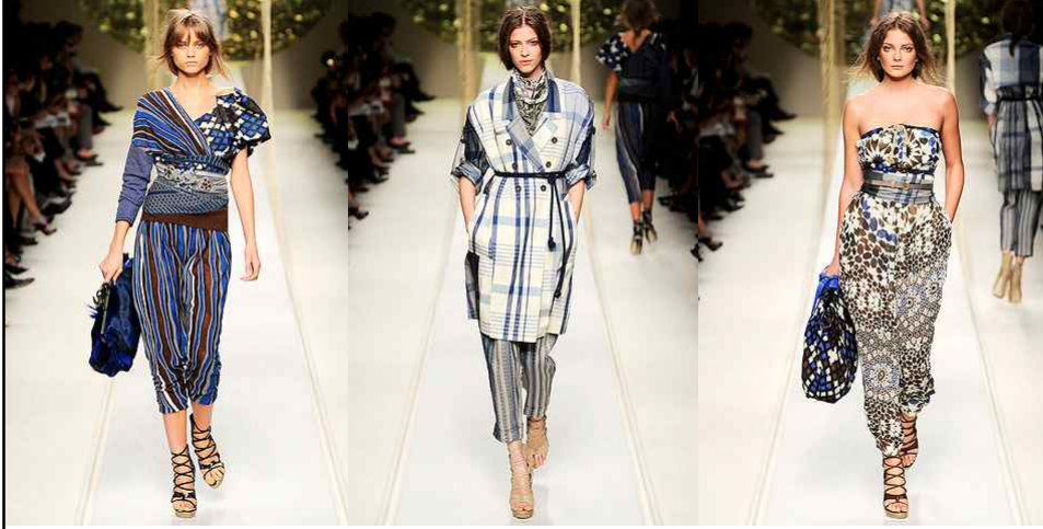
Spring 2010 Ready-to-Wear Kenzo